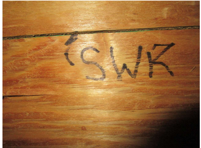
SECONDARY WATER RESISTANCE